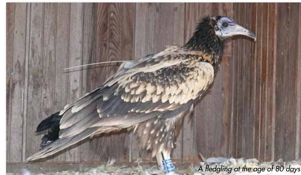
A fledgling at the age of 80 days