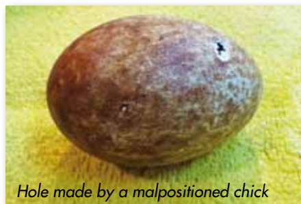
Hole made by a malpositioned chick

The chick pips the shell in the small end of the egg and earlier than expected (both internal and external pip). It's necessary to often check the shell carefully because the chick only opens a small hole which is not easy to detect (more often it consists of small cracks of the shell which can be more easily detected by touching).