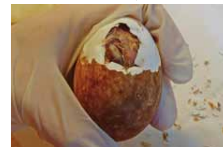
Intervention on a malpositioned chick

The whole process, between the shell crack and the hatching, takes about 3 days.