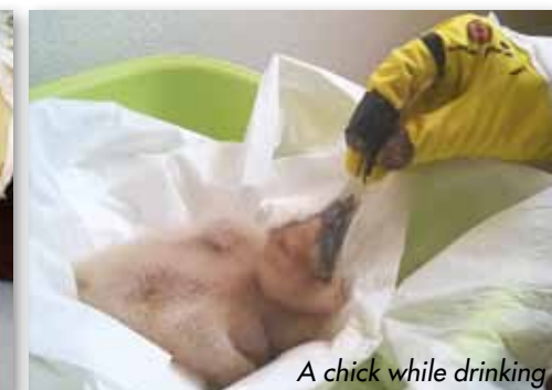
A chick while drinking