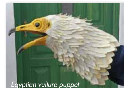
Egyptian vulture puppet

First of all the contact with the keepers is avoided, especially when the chicks are between 5 and 15 days old. When an Egyptian vulture pair or a single male are available for the adoption, the