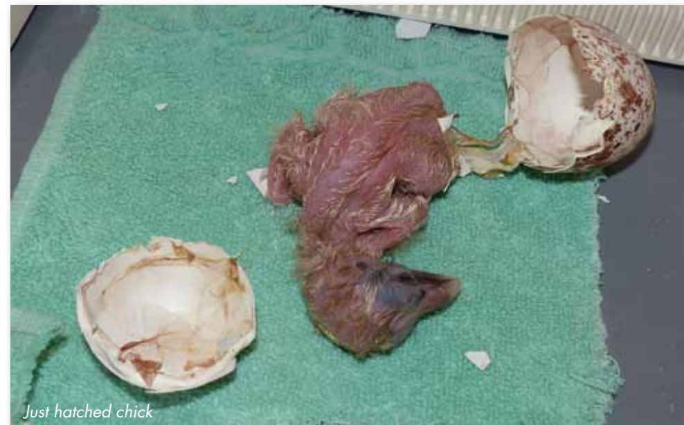
Just hatched chick

From the time the chick breaks the internal membrane until it escapes from the shell three days usually elapse.