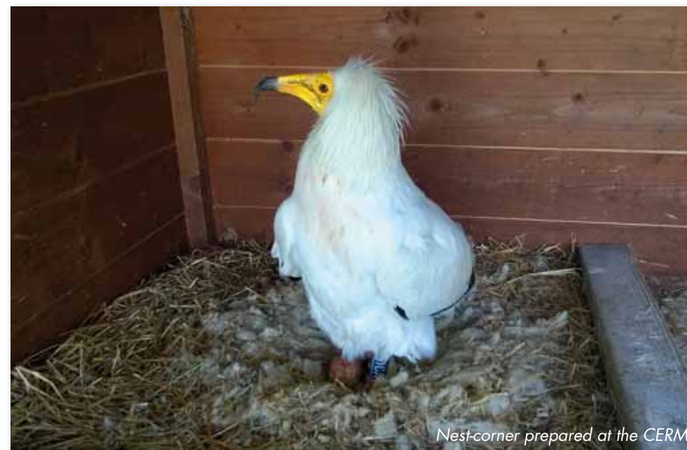
Nest-corner prepared at the CERM

Every aviary of the CERM has a nest-box measuring about 2 m x 1 m x 1 m (width x length x height). Inside every nest-box an angle limited by wooden