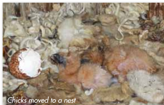
Chicks moved to a nest

Otherwise all the chick's management operations must be carried out with the operator body adequately disguised (covered with a vest, mask and dark glasses) and in silence, wearing on the arm which supplies food and water to the chick a puppet with the shape of a neck and head of an adult Egyptian vulture.