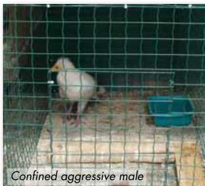
Confined aggressive male

In the breeding season 2018 a new technique was tested on four pairs. As soon as the males showed signs of aggressiveness they were moved to a small cage placed in the pair aviary where they couldn't see the nests. Five days later they were set free. This method seems to be successful as three males stopped being aggressive and the pairs returned to copulate. The fourth male continued to be aggressive but in this case the pair had never started copulating.