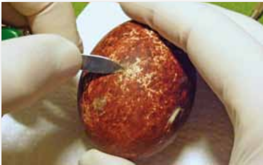
Cleaning of an egg before its artificial incubation