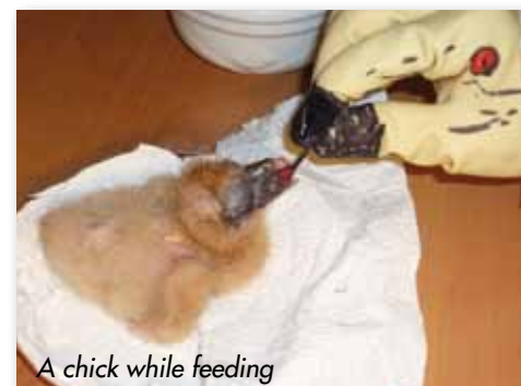
A chick while feeding