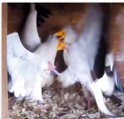
Female attacking her mate with a chick in the nest

Also the pairs which have a normal behaviour during the courtship and/or the mating period may have problems during the incubation and/or hatching. These are usually due to an anomalous behaviour of the females which may: